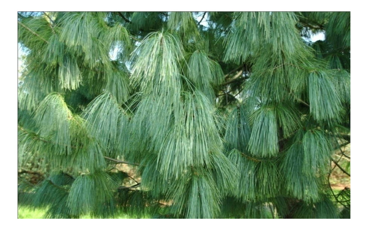
Figure 1. Pinus wallichaina

The leaves samples of pinus Roxburghii (chir pine) and resins were collected in fine plastic bags duly labeled with date and areas of collection of samples. The collection of samples based on ethnobotanical uses by inhabitants of rural areas of Kotli sattian (Rawalpindi) . The resin was extracted from bark of pinus tree in fine plastic bags and treated separately. The samples were identified by a taxonomist by expert from Department of Botany PMAS Arid Agriculture University Rawalpindi and voucher specimen (No. 142) was deposited for future reference. Around 3 kg of plant material were moved to UIBB ,PMAS Arid Agriculture University Rawalpindi. for further process (13).