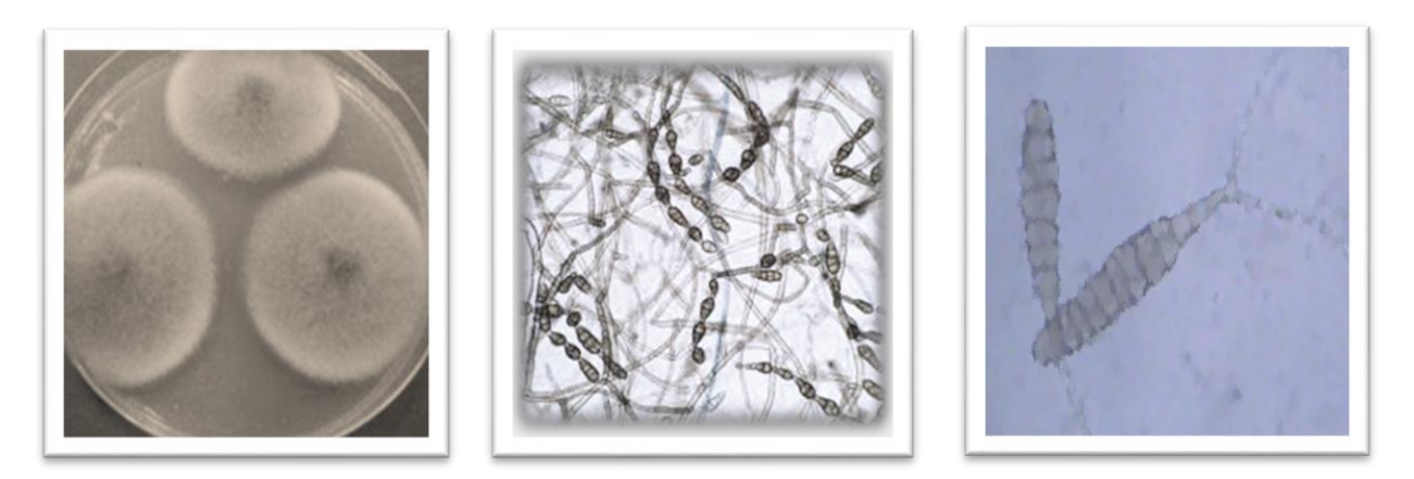
Fig 1: Colony color and texture. Figure 2 and 3: Spores, Conidiophores of Alternaria solani

The fungal pathogen was identified followed by morphological and microscopic features. Circular and irregular colonies were observed showing whitish to dark brown colour and colony texture (Fig 1). Colonies were velvety and fluffy in appearance showing dark color spores. The conidiophores exhibited a brown color and were occasionally observed to have a zigzag shape. They were also characterized by having septa. The fungi produced either simple or branched large spores (6-11 x 23-35 \mu m) with horizontal and vertical divisions (Figure 2 and 3).